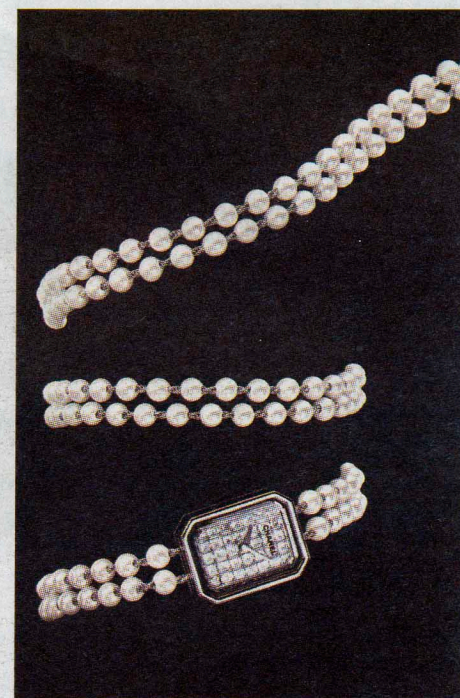
From far right: the Manometro with ivory dial and Manometro Chrono with black dial, both from Argento Fine Products; Chanel's Ruby Tourbillon; Chanel Première 20th anniversary watch

The anniversary watch is available exclusively in Chanel Fine Jewellery boutiques.